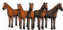
The expedition relied on 24 horses to cross the Rocky Mountains.