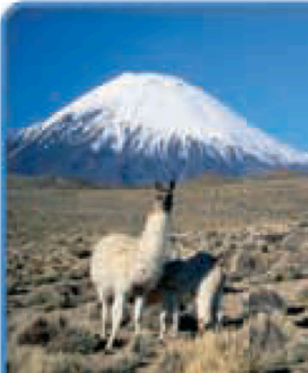
The high Andes affect the climates and landscapes of Pacific South America.

Use the visual summary below to help you review the main ideas of the chapter.