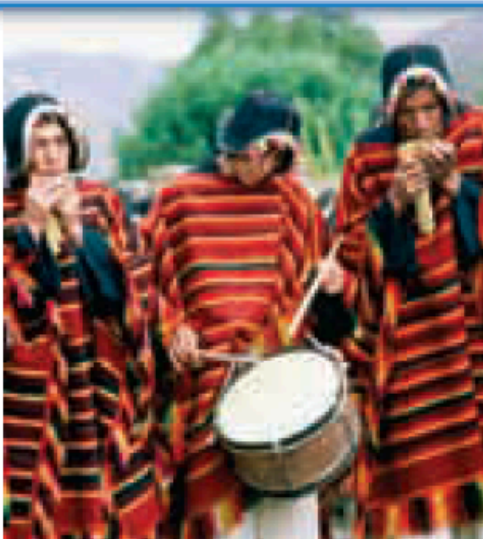
Many South American Indians maintain traditional customs and ways of life in the Andes.