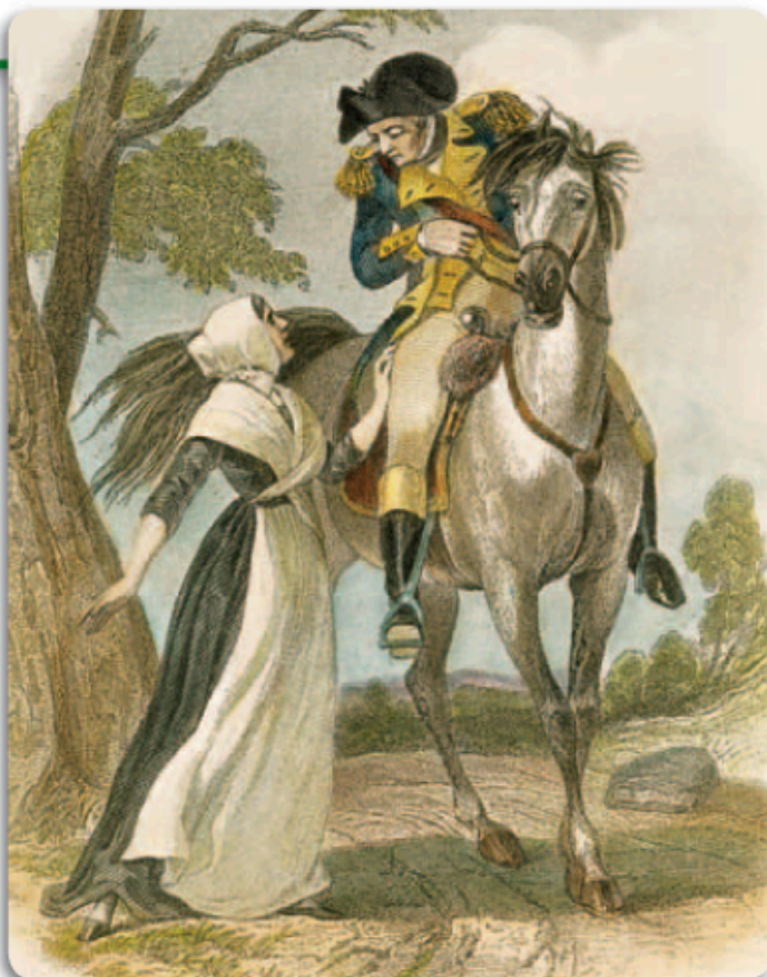
A female spy passes news to a colonial officer.

“Born for liberty, disdaining to bear the irons of a tyrannic Government, we associate ourselves . . . [with those rulers] who have extended the empire of liberty, and contented to reign by sweetness and justice, have broken the chains of slavery, forged by tyrants.”