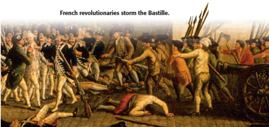
French revolutionaries storm the Bastille.

The storming of the Bastille was one of the first acts of the French Revolution —a rebellion of French people against their king in 1789. The French people overthrew their king and created a republican government.