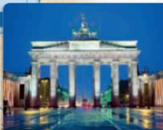
The Brandenburg Gate, above, connects eastern and western Berlin. For 28 years, the Berlin Wall blocked the gate. It reopened in 1989.