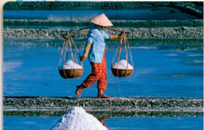
A woman uses traditional methods to carry sea salt across the salt pans in Doc Let Beach in Vietnam.

Thailand is a constitutional monarchy. A monarch, or king, serves as a ceremonial head of state. A prime minister and elected legislature hold the real power, however.