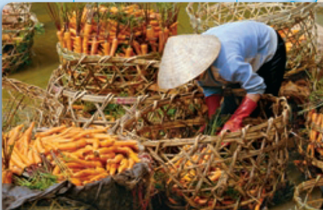
A Vietnamese woman gathers and washes carrots in traditional woven baskets.