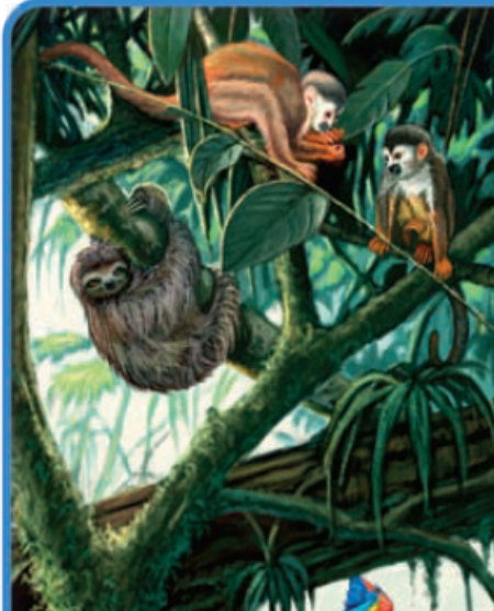
The lush Amazon rain forest covers a huge part of the region.

Use the visual summary below to help you review the main ideas of the chapter.