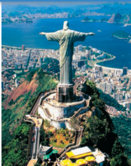
Brazil has many large cities as well as large rural areas.