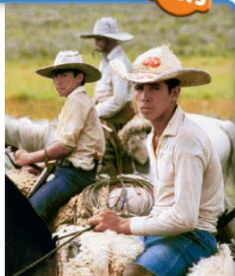
Argentina, Uruguay, and Paraguay have large plains that are good for ranching.