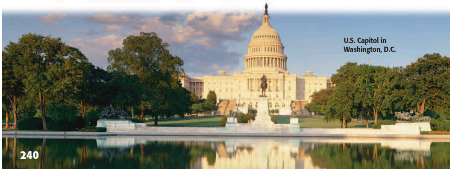
U.S. Capitol in Washington, D.C.

Hamilton and Jefferson also fought over how the country's economy should grow. Hamilton wanted new forms of economic growth. He wanted to promote manufacturing and business. He even suggested that the